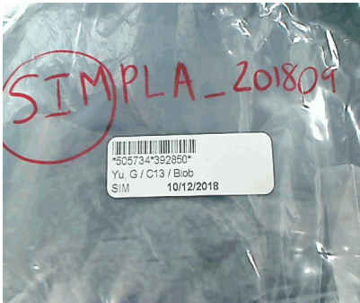
Package received - labeling COC

Laboratory Number Beta-505734 Percent modern carbon (pMC) 101.34 +/- 0.3 pMC Atmospheric adjustment factor (REF) 100.5; = pMC/1.005