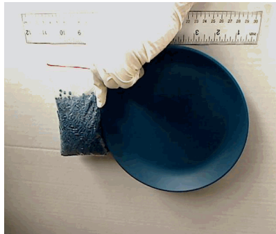
View of content